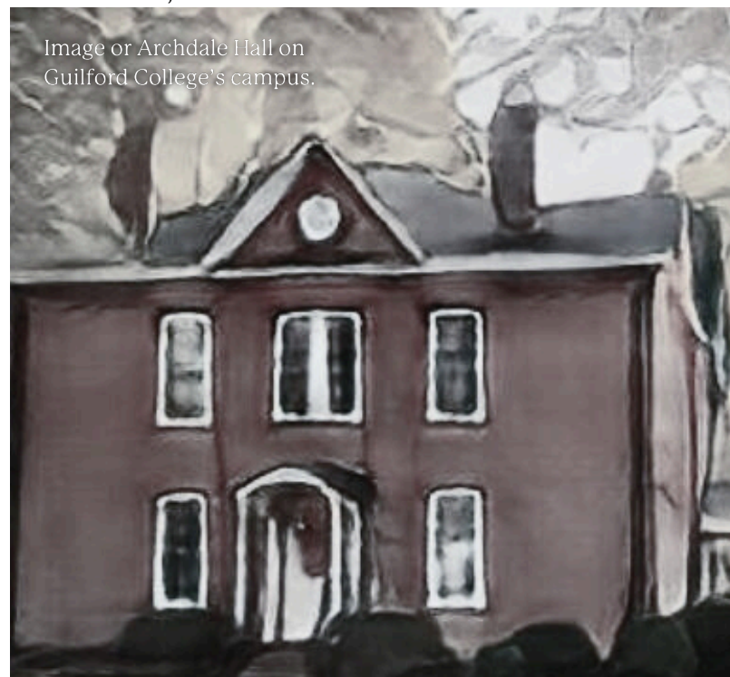
Image of Archdale Hall on Guilford College's campus.